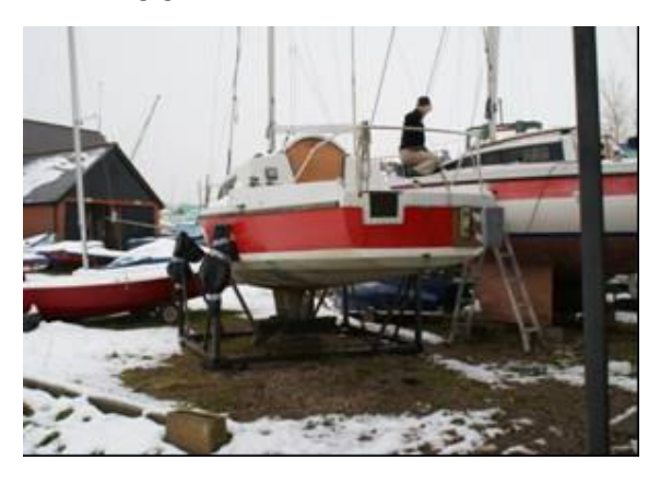
but the work goes on - it's only a few flakes

Although one hardy soul was not put off by the harsh weather conditions and was determined to be back in the river by the spring – an inspiration to us all. The hard working party on 13 March was also well supported and the lifting group have been active producing the schedule for boat launching given below.