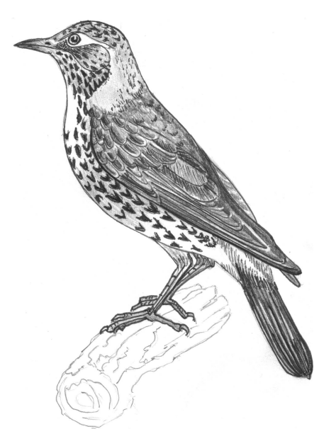
the field fare (Gill Maloney)

Throughout the year they eat worms and insects on the ground and other fruits and berries on the trees, hedges and bushes. They breed in north and east Europe in wooded regions building a nest cup of grass and twigs and laying five or six eggs in a bush or a tree. Their life span varies from 5 to 10 years. Field fares move around in flocks; when you spot one or two hunt around or wait for them to fly for there will be a dozen or more. They spend most of the day feeding, stripping bushes bare of their berries before moving on. They tend to follow the fruit and berry crops south. Tim Denham