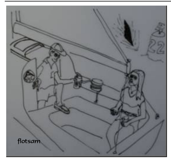
..Well I can't see what all the global warming fuss is about