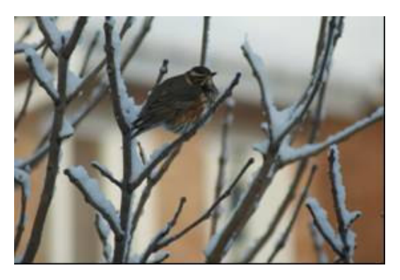
*also seen in a Wivenhoe garden