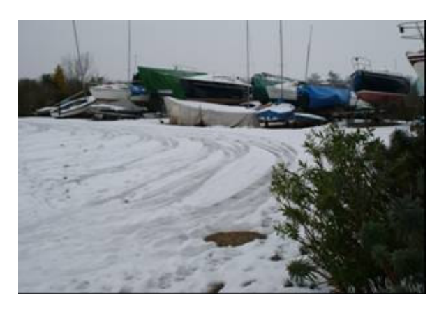
even the boats were wrapped up this winter

But there were times when you wondered whether the winter would ever end and what the talk of global warming really was all about? It seemed like fitting-out was a distant objective and that 'Burns night' might be the high spot of the Calendar.