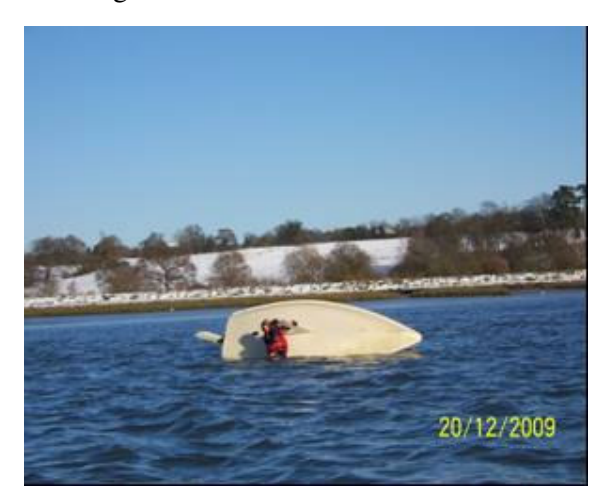
this is how it's done

WSC taken by Phil Thompson. Some even went in the water, hopefully not for too long at those temperatures and the safety boat was at hand – and not only to capture the image!