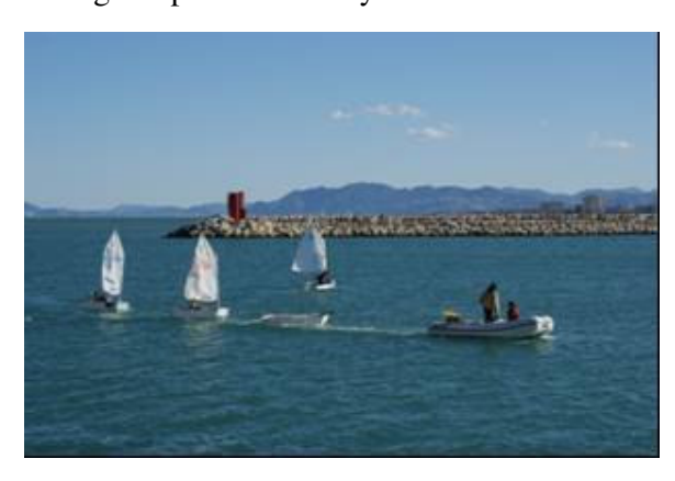
all present and correct?

Sometimes a more active helping hand is needed from the safety boats, as witnessed in February this year, on the Mediterranean coast of Spain, near Valencia, where the America's Cup had just been contested. Here some young enthusiasts were brought in to a safe haven, after an apparent mishap during a trip out in the bay.